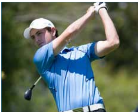
Patrick Cantlay twice earned All-America honors at UCLA.

Cantlay earned the 2011 Jack Nicklaus Award, in addition to securing the Phil Mickelson Award and GolfWeek's Player of the Year honors that year. He was selected 2011 Pac-10 Golfer of the Year and Freshman of the Year.