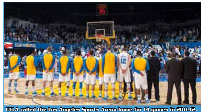
UCLA called the Los Angeles Sports Arena home for 14 games in 2011-12.