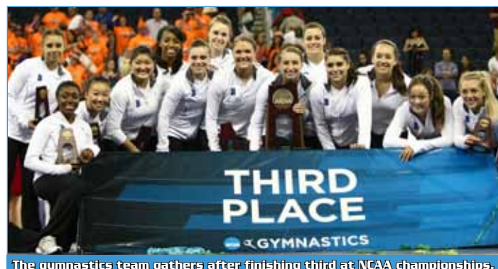
The gymnastics team gathers after finishing third at NCAA championships.