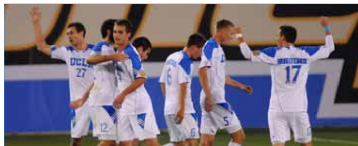
The men's soccer program earned its 13th College Cup appearance.