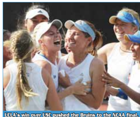
UCLA's win over USC pushed the Bruins to the NCAA final.

UCLA won the Pac-12 title at conference championships, earning a victory in comeback fashion on balance beam in the final rotation to win its 17th conference title. The Bruins recorded 197.425 to outscore second place and host team Utah (197.375). The Bruins kept close throughout the meet and showed tremendous grace under pressure in the final rotation, scoring 49.375 on beam to overtake Stanford and hold off a surging Utah.